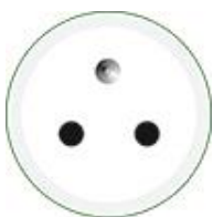
Socket/Plug: CEE 7/5 (French)