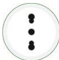
Socket/Plug: CEI 23-50 S17/P17 (Italian)