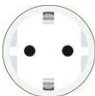
Socket/Plug: CEE 7/4, German "Schuko"