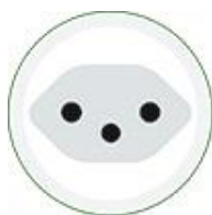
Socket/Plug: SEV 1011 (Swiss)