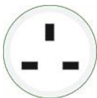
Socket/Plug: BS 1363 (British)