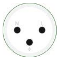
Socket/Plug: SI32 (Israeli)

Pictures below describe the plugs and sockets of other models.