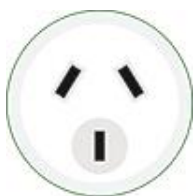
Socket/Plug: AS/NZS 3112 (Australian)